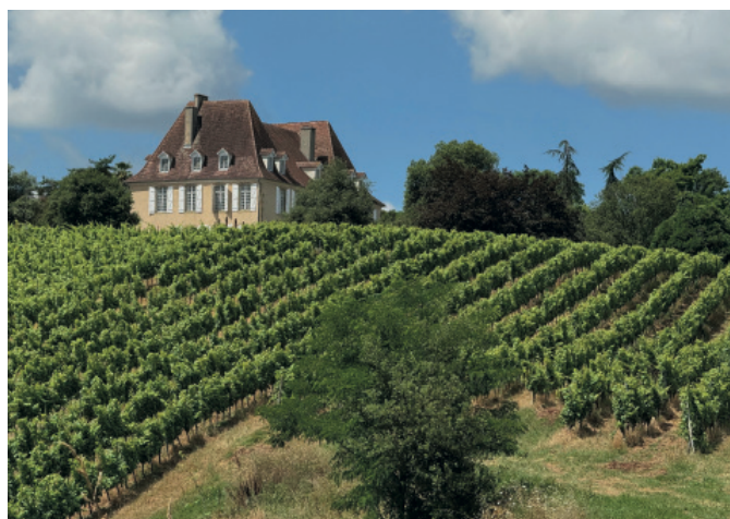
Madiran wines are known for their deep, complex flavours