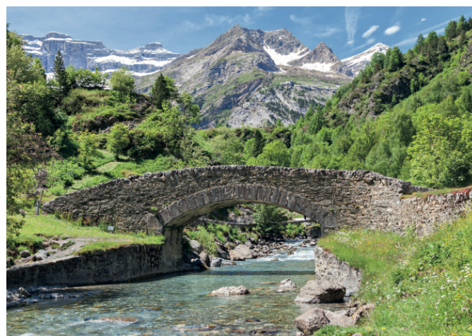
The Pyrénées form a stunning backdrop to the whole region

The grand Boulevard des Pyrénées, lined with palm trees and offering spectacular panoramas, is the perfect place